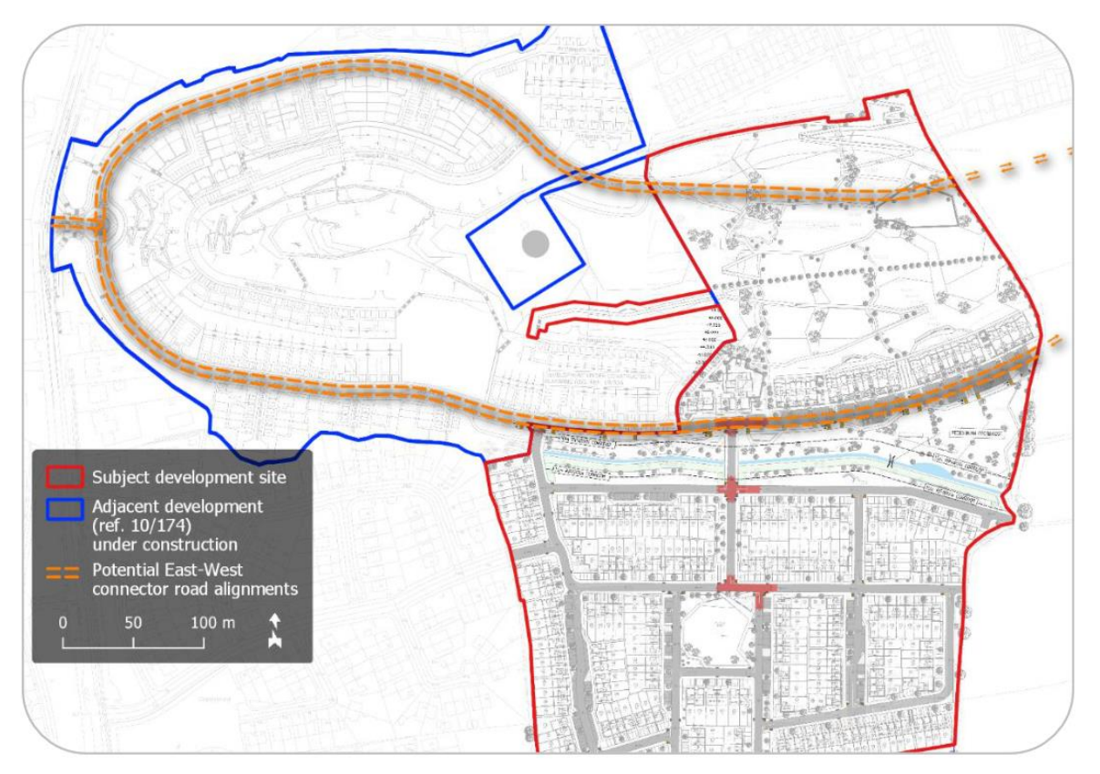
Figure 2.2: Potential Connections to Lands to the East